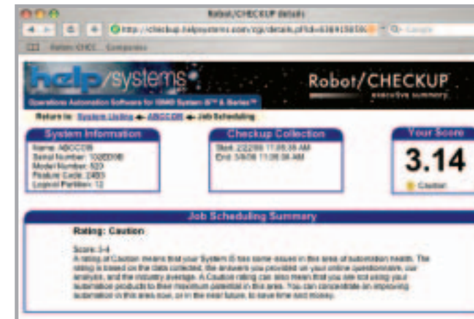
Each automation area has a Summary section that explains your automation rating for that area.

In the System Automation Health section of the Executive Summary, you can click on an Info link for each of the six automation areas. The Info link opens a Summary section that displays your rating and score, and explains your automation rating for that area.